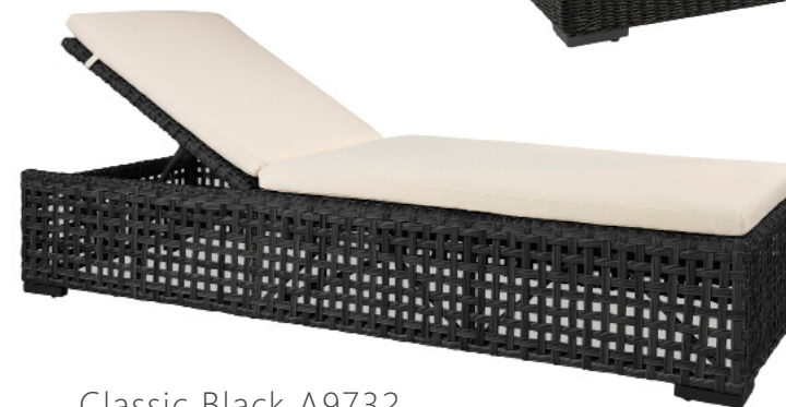
Classic Black A9732