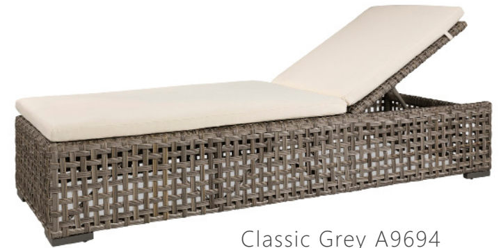
Classic Grey A9694