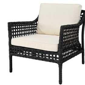
Santa Monica Armchair