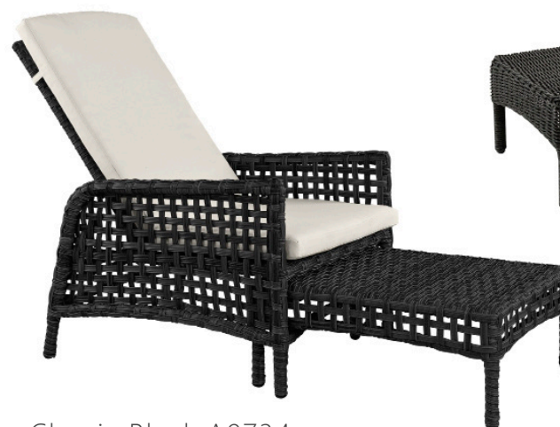
Classic Black A9734