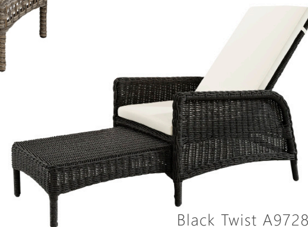
Black Twist A9728