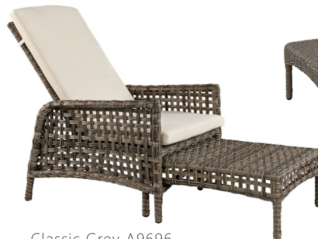
Classic Grey A9696