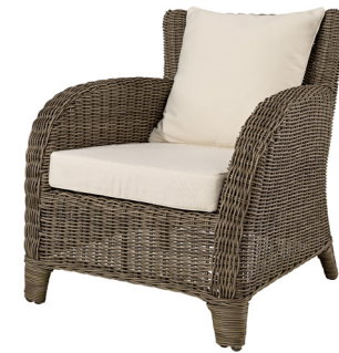
Rhode Island Armchair