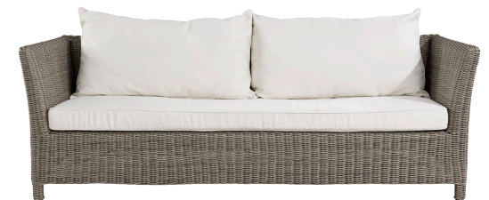
Augusta 3 Seat Sofa