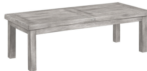
Vintage Outdoor Coffee Table