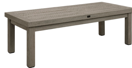
Vintage Outdoor Coffee Table