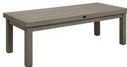
Vintage Outdoor Coffee Table