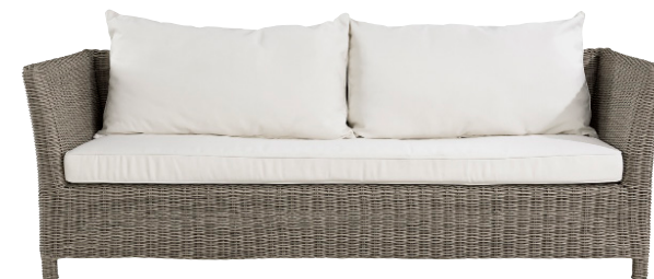
Augusta 3 Seat Sofa